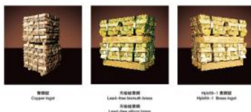
铜锭 Copper ingot