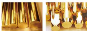
铜棒 Copper bar